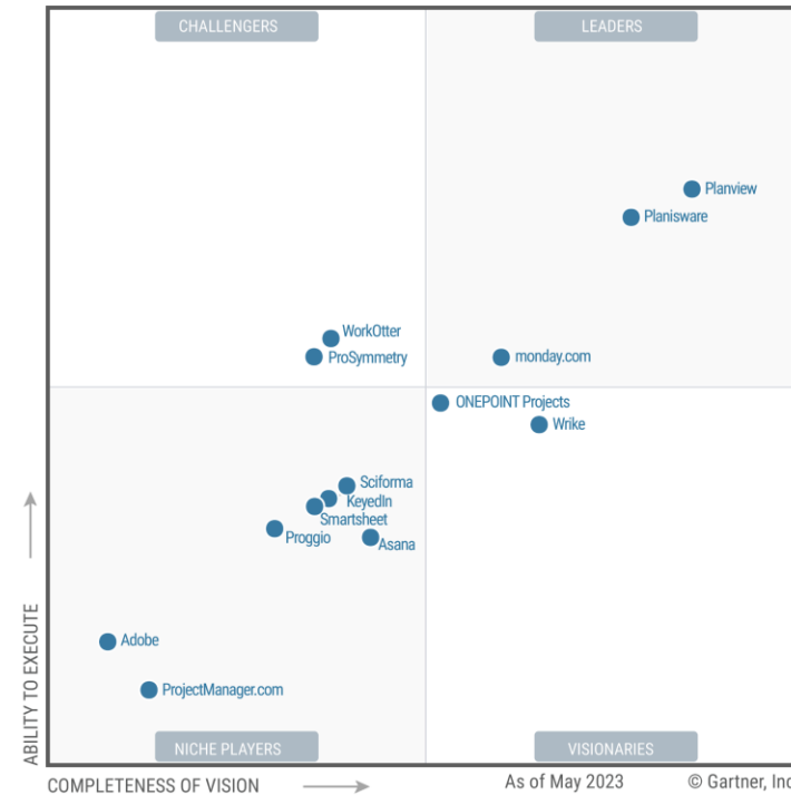
Figure 1: Magic Quadrant for Adaptive Project Management and Reporting