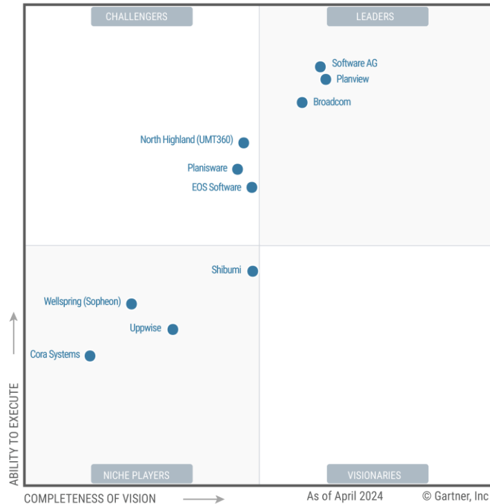
Figure 1: Magic Quadrant for Strategic Portfolio Management